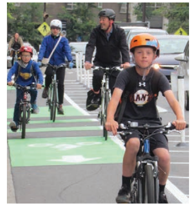
Berkeley, CA

The Philadelphia School 2500 South Street