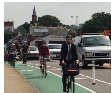
New York, NY